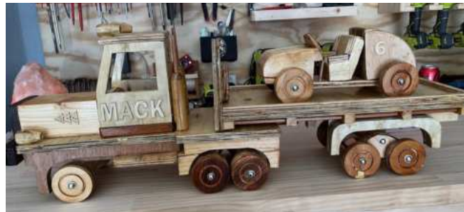
Semi, Trailer and Sports Car