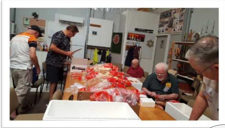
Preparation for 20th January 2024

Conduct of Sausage Sizzle 16 March 2024.