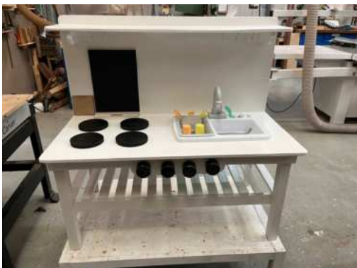
Small Mud Kitchen with Battery Operated Tap