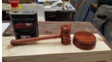
Gavel and Sound Board