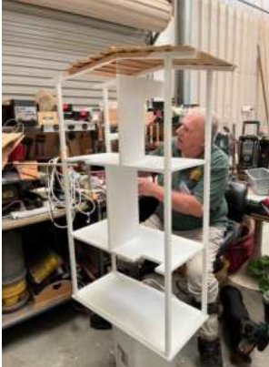
Doll's House No 2