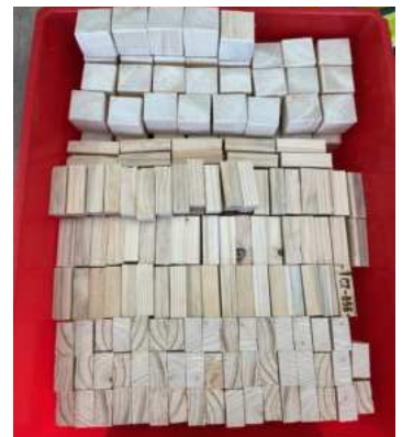
50 Minecraft People