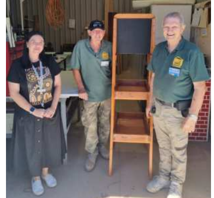
School Fruit Stand