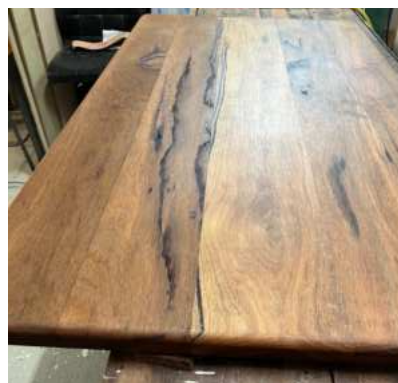
Reconditioned Table Top