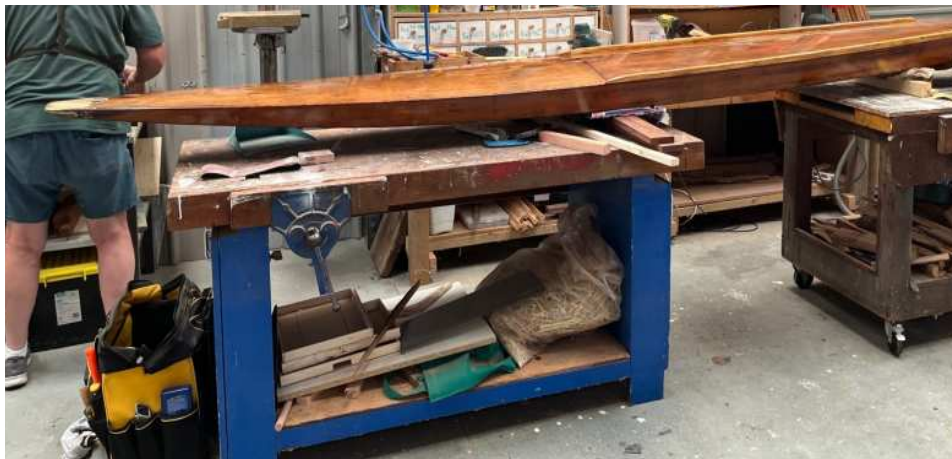
First of Two Reconditioned Surf Skis